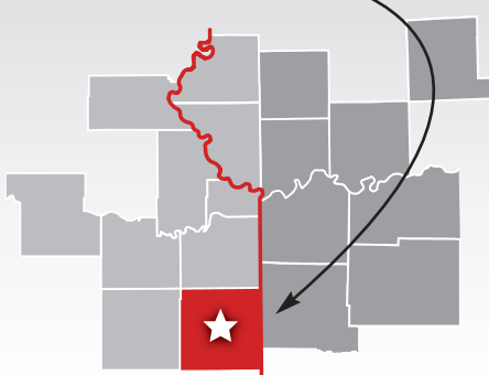
MIAMI COUNTY, KANSAS

Navy and NASA have helped Taylor Forge grow into the new space.