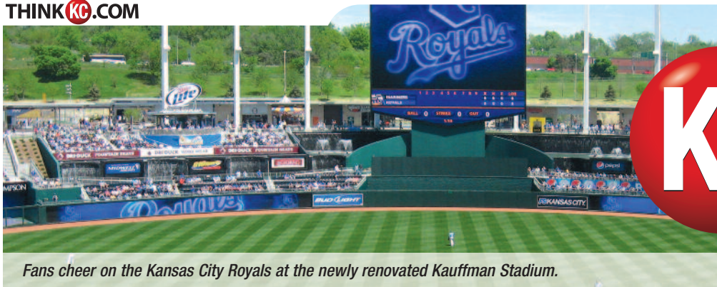
Fans cheer on the Kansas City Royals at the newly renovated Kauffman Stadium.